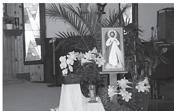
St. Gregory the Great Easter.